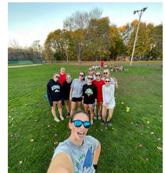
Friends & host family